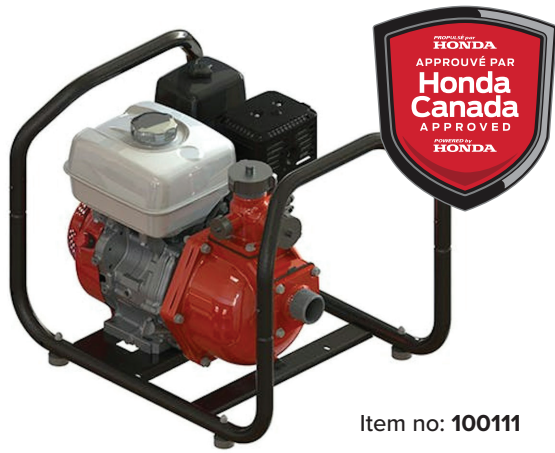
Item no: 100111

The VS2-9W pump is powered by a 9 HP Honda engine configured to be portable with a wraparound frame.