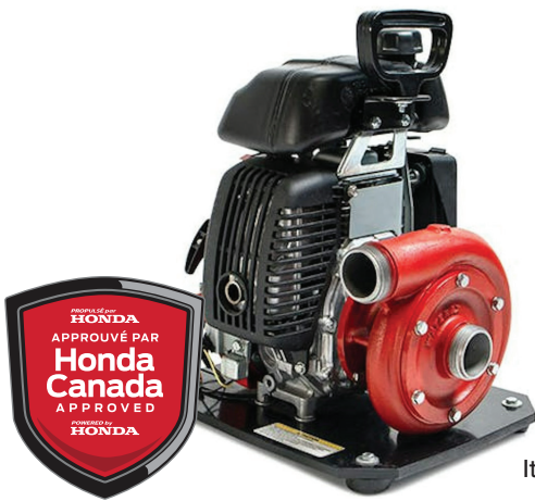
Item no: 100053

The MINI-STRIKER® lightweight high-pressure pump is well suited for initial attack operations and is a very popular choice for entry-level skid applications. The MINI-STRIKER® combines a single-stage pump end powered by a reliable Honda 4-stroke 2.5 HP engine to generate class leading performance.