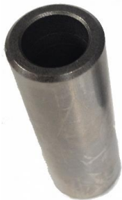
“Old” gudgeon pin

The new gudgeon pin has a more modern design. Its inner diameter is tapered: the pin is thinner at the edges and becomes thicker towards the center where the forces and stresses are greater. The result is a new gudgeon pin that is 19% lighter than the previous design. The lighter weight helps increase the durability of the crankshaft and bearings. The item number (800030) remains unchanged.