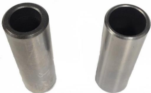
“Old” gudgeon pin

The new gudgeon pin has a more modern design. Its inner diameter is tapered: the pin is thinner at the edges and becomes thicker towards the center where the forces and stresses are greater. The result is a new gudgeon pin that is 19% lighter than the previous design. The lighter weight helps increase the durability of the crankshaft and bearings. The item number (800030) remains unchanged.