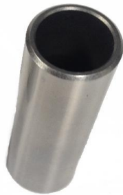
“New” gudgeon pin