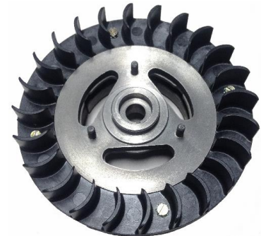
801164 for POINT (NEW)