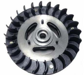
801164 for POINT (NEW)