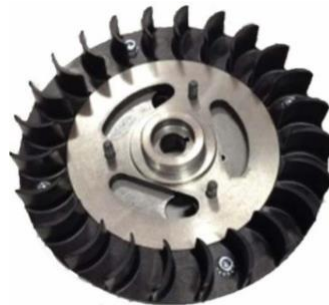
600535 for CDI (NEW)

*Important: R-667NS Flywheel/Magneto/Fan assemblies for POINT ignition (801164) are available in limited quantities . Once the stock is depleted, the item will no longer be available due to obsolescence of magneto tooling.